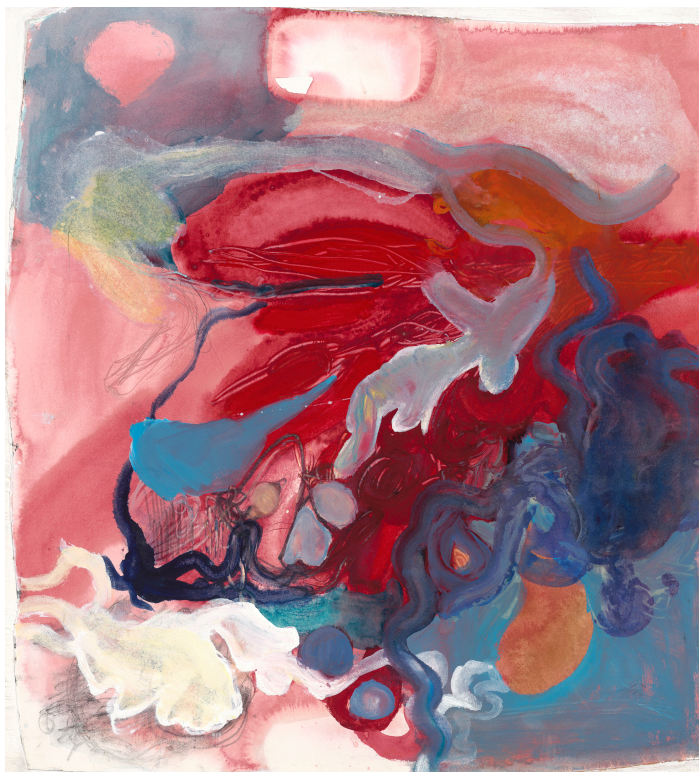
Untitled ID: 021. Watercolor, sumi ink, pastel on paper . 21.4 x 23 in (54 x 59 cm) Reference: Book, Ariane. Author José Ignacio Abeijón. 2019, p. 61